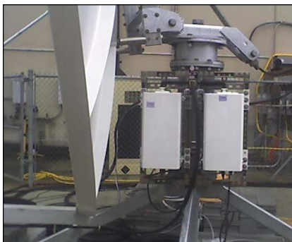
Antenna-mount 1:1 system w/ mounting frame