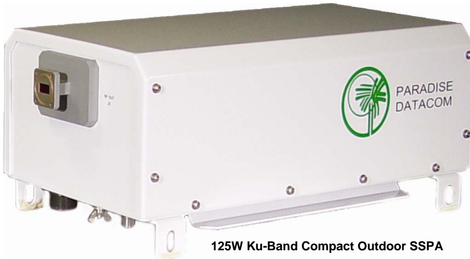
125W Ku-Band Compact Outdoor SSPA