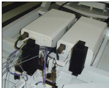
SNG-mount 1:1 system w/ side-mount AC input